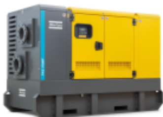
CNP PAS 100MF