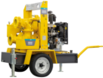
TRAILER PAS 150MF