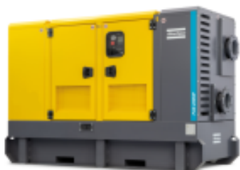
CNP PAS 200MF