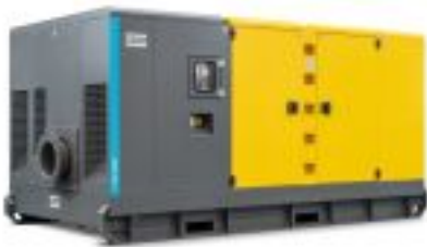
CNP PAS 300HF